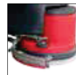
Rubber blade set