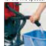
Easy to empty