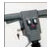
On the reverse of the handle is a switch for the two speeds.